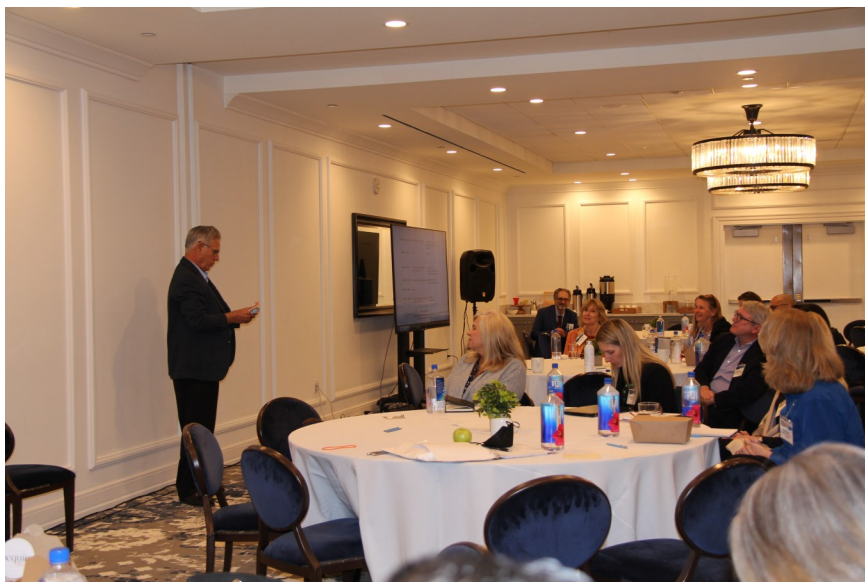
2023 Defense Counsel Summit

Thank you and we look forward to sharing more with you in the December edition of the Quarterly Update.